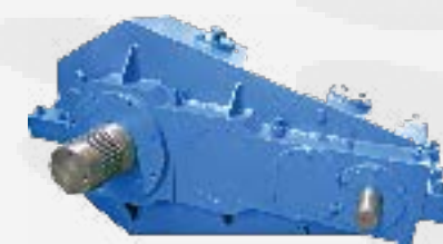
Crane & Hoist