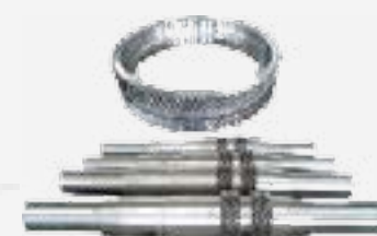
Oil & Gas