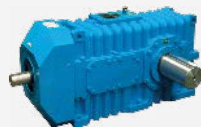
General Purpose / Bulk Material Handling

Our unique history of providing gearboxes and drive solutions for the world's most challenging applications means that NGC's products have been engineered and precisely tested to deliver reliable operation 24/7. As with any equipment investment, you need a solution that will ensure the lowest total cost of ownership while producing maximum return - uninterrupted.