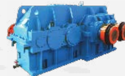
Rubber & Plastic